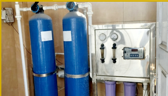
R.O. WATER FACILITY